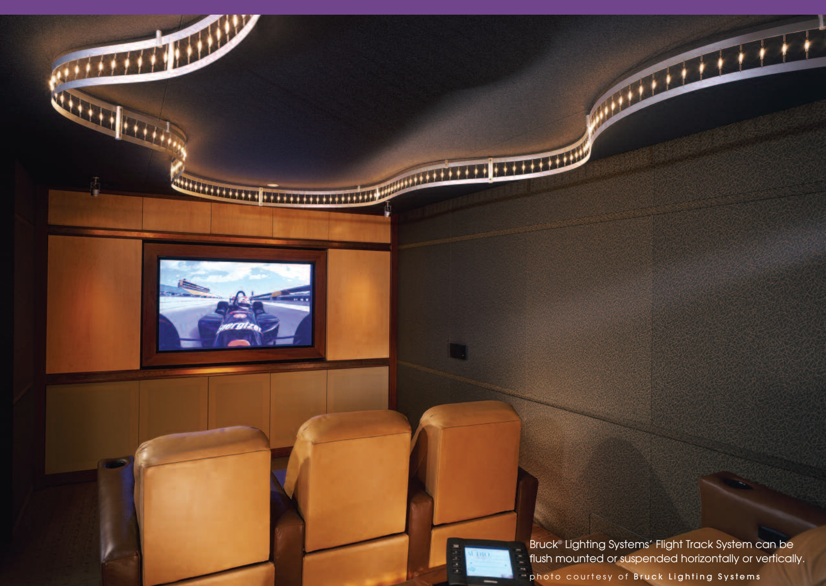
Bruck® Lighting Systems' Flight Track System can be flush mounted or suspended horizontally or vertically.

And thanks to Fanimation®, homeowners no longer have to choose between the clean lines of a lighting fixture and the practical comfort of a ceiling fan. Their Air Shadow™ collection features blades which retract when not in use.